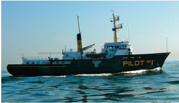
Pilot Boat New York AIS; "Pilot 1"