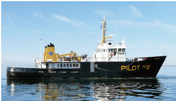
Pilot Boat New Jersey AIS; "Pilot 2"