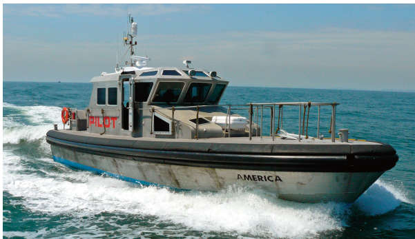
Pilot Boarding Launches America, Phantom, Wanderer, Yankee